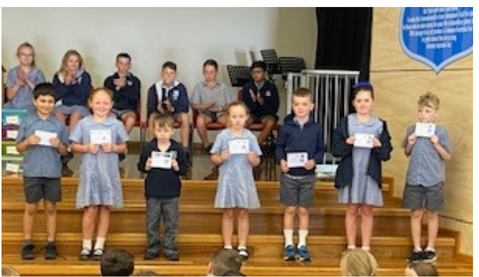
Principal Award Winners, Stage 1